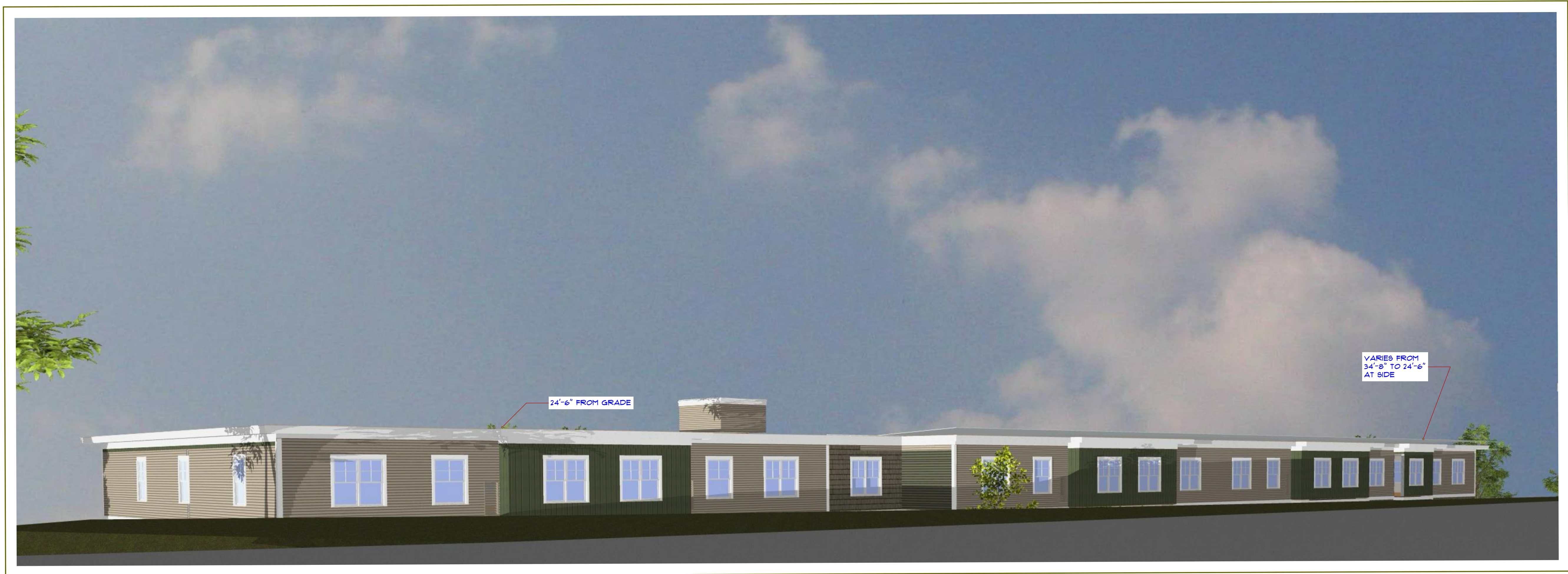
VIEW FROM ROAD

FIRST FLOOR 4 ONE BEDROOM UNITS 1 ONE BEDRM ACC UNITS 1 TWO BEDROOM UNITS